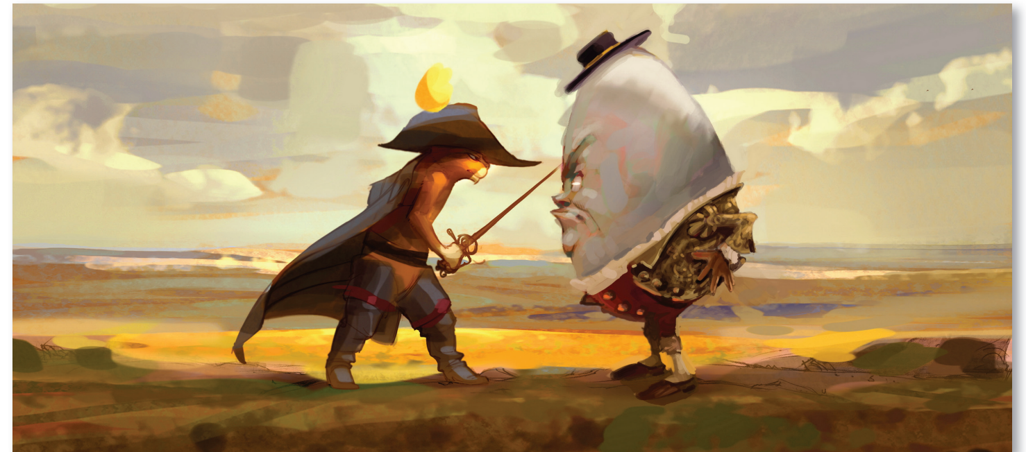
Puss In Boots - Nathan Fowkes, Faculty, ©Dreamworks