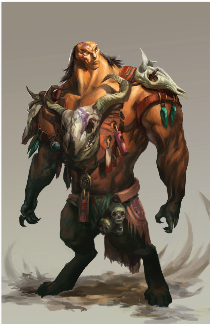
Maisie Yang, Student